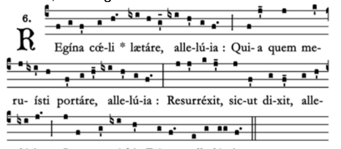
lú-ia: Ora pro nó-bis Dé-um, alle-lú- ia.

During the Easter Season we don't recite The Angelus, but instead we use the Easter Marian Anthem, the Regina Caeli .