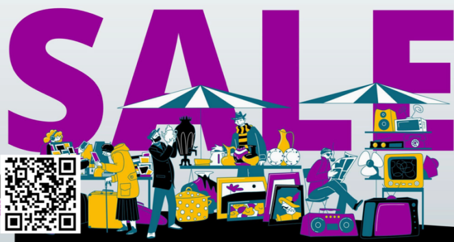
TABLE TOP & CAR BOOT

Monday 25 th August 10am to 4pm St Dunstan's Church